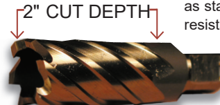
Type 13LSP M2, Hi-Tungsten